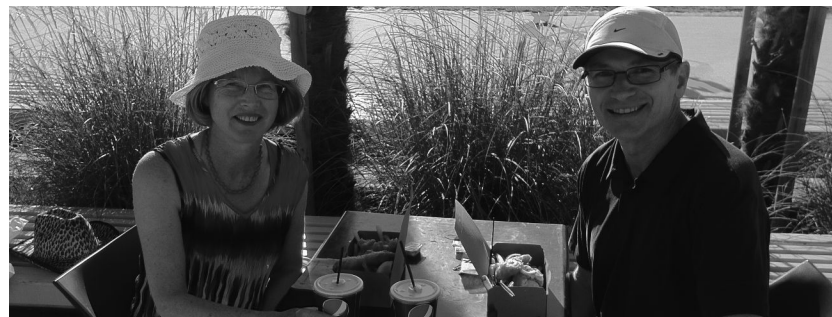
Outdoor lunch, Kitsilano beach, Vancouver

The first portion of leave I actually spent in silence! I was able to arrange a silent, guided retreat at the Home of Compassion in Island Bay in Wellington. The setting was beautiful and I was able to rest and spend unhurried time with God – my faith was rejuvenated!