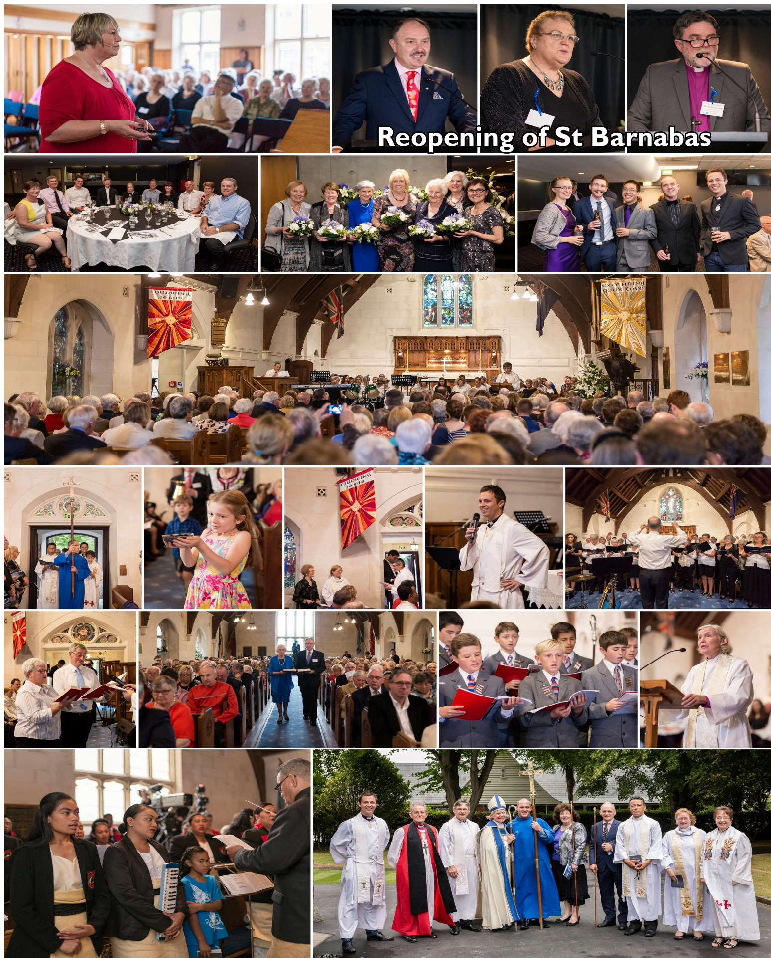
Reopening of St Barnabas