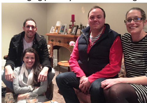
Alpha Marriage Prep Couples