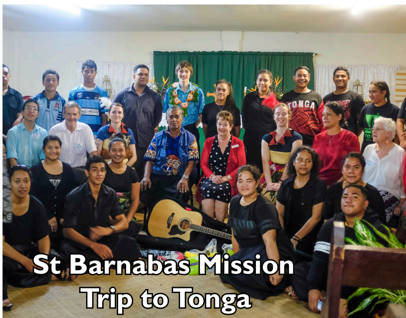
St Barnabas Mission Trip to Tonga