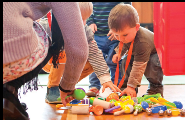
Last Mainly Music for term